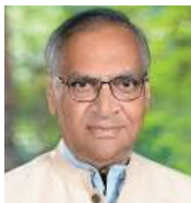
Shri Vivek Shejwalkar Ji, Sansad, Lok Sabha Govt of India